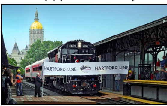
The New Haven-Hartford-Springfield Rail Line Launch

On June 16, the Hartford Line celebrated its second anniversary. The service, running from New Haven to Hartford and Springfield, has carried more than 1.2 million passengers since its launch in 2018.