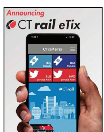
New CTrail eTix mobile App

"Our focus is on enhancing the customer experience and encouraging people to