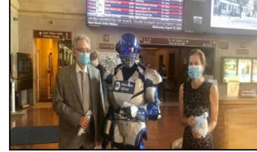
CT Lieutenant Governor Susan Bysiewicz hands out free masks with Commissioner Giuletti

reminding customers to wear face masks and practice social distancing.